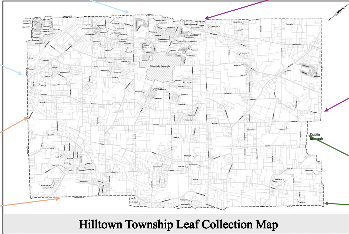
Hilltown Township Leaf Collection Map